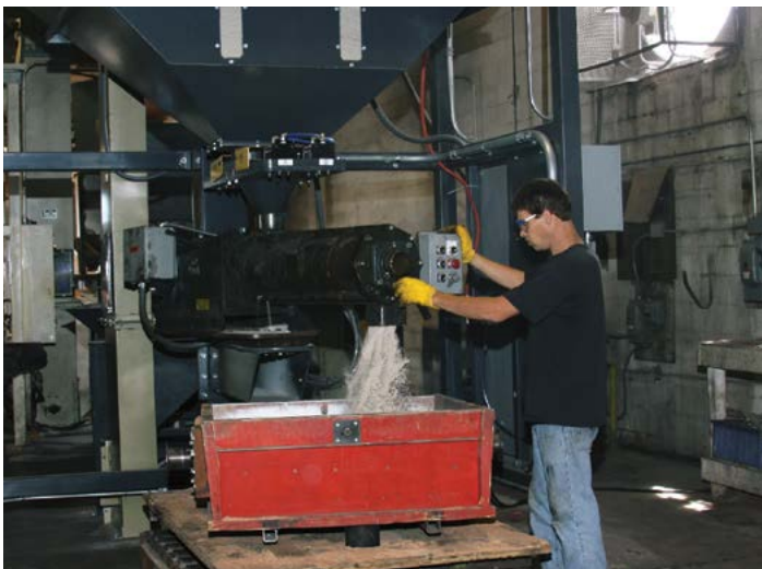
Air Set Molding Process