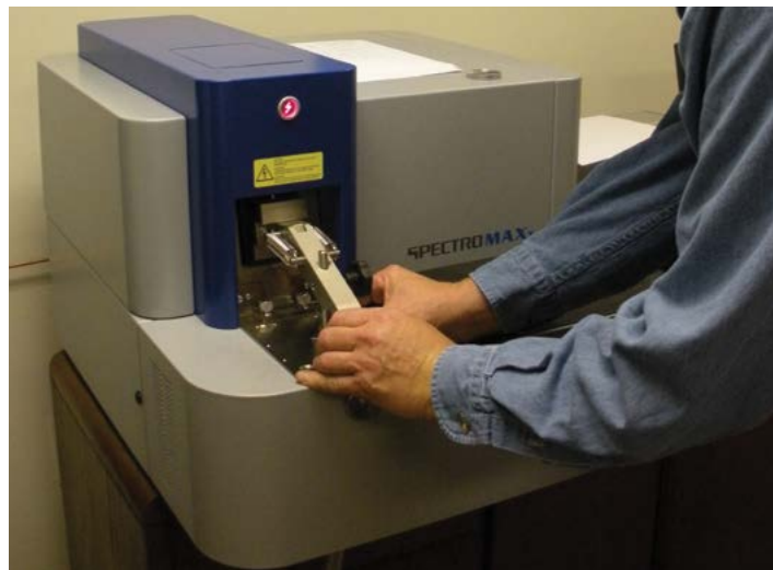
Quality Spectrometer Testing