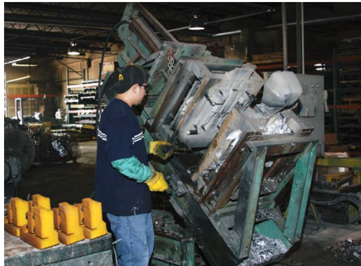
Permanent Molding Process