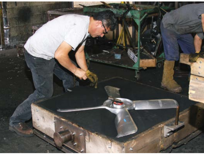
Loose Piece Molding