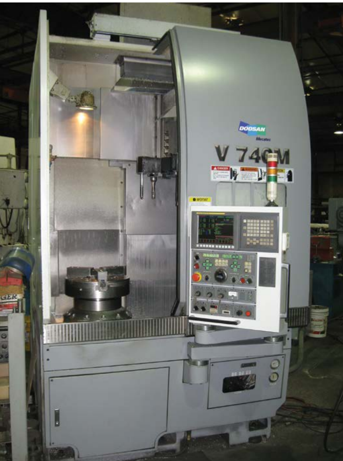
Internal Machining Capabilities