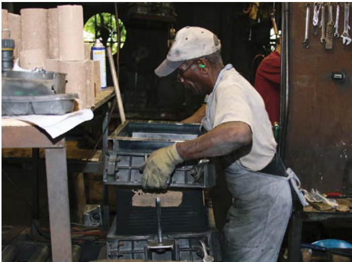
Squeezer Molding Process

Twin City Holland Industries is strategically located in Davenport, IA in the heart of the Midwest and just three hours west of Chicago. Our 30,000 square foot facility is minutes from Interstate 80 and Interstate 74 making shipping by truck convenient and cost efficient. Our products are shipped to customers throughout the United States as well as Canada, Mexico and South America.